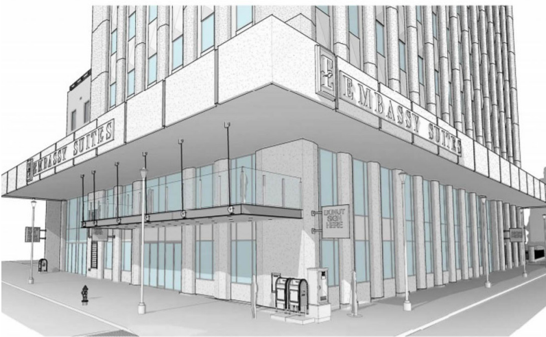
3D View FROM GAY & UNION

Fixed on the corner of Gay St. and Union, the William F. Conley building is a 13-story, 154,000 SF Embassy Suites. Previously used as office space for banks and other businesses, the new hotel features a restaurant on the first floor, 160+ hotel units, 2 condos on the top floor, as well as a rooftop bar and swimming pool. The $40M project will feature local art, pink Tennessee marble, and other local touches throughout the building. To undertake the renovation, S2A created as-built documentation of the interior to make plans for the demolition of the interior, as well as giving reference for the rest of the build.