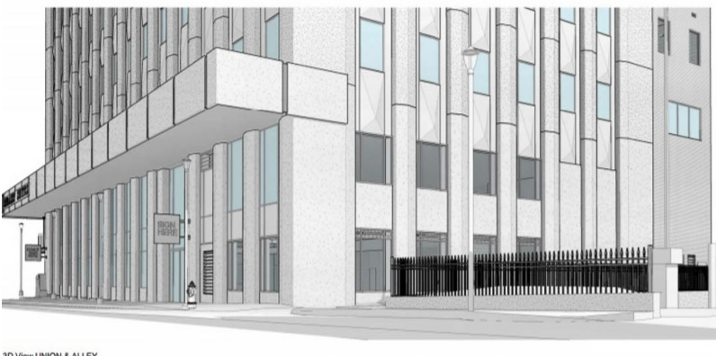
3D View UNION & ALLEY