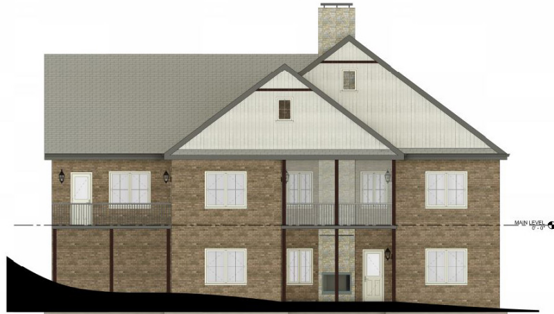
① NORTH ELEVATION 1/4" = 1'-0"