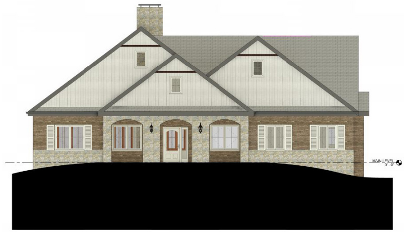
① SOUTH ELEVATION - ENTRY 1/4" = 1'-0"

S2A was contracted to schematically design a 3,246 Sq. Ft., 2 story residential home for a retired family. The 3-bedroom residence has an entertainment room, crafts room, laundry, multiple covered patios, family room, office, and open floor plan for a large kitchen and dining area. S2A used hand-drawn markups, assisted the client with visualizing the final concept and walked with the contractor for permitting.